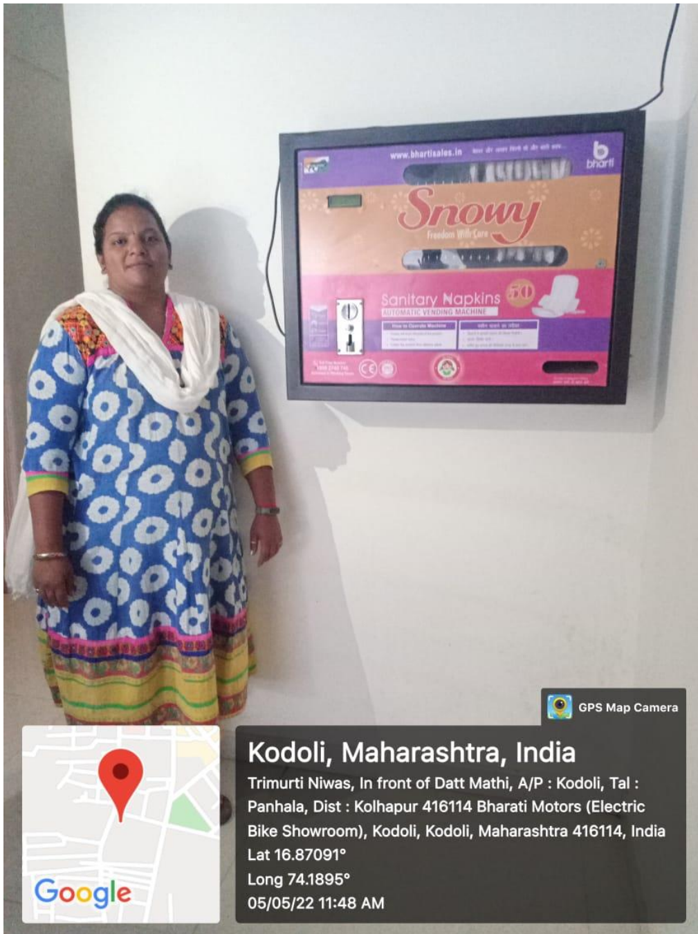
Sanitary pad vending machine