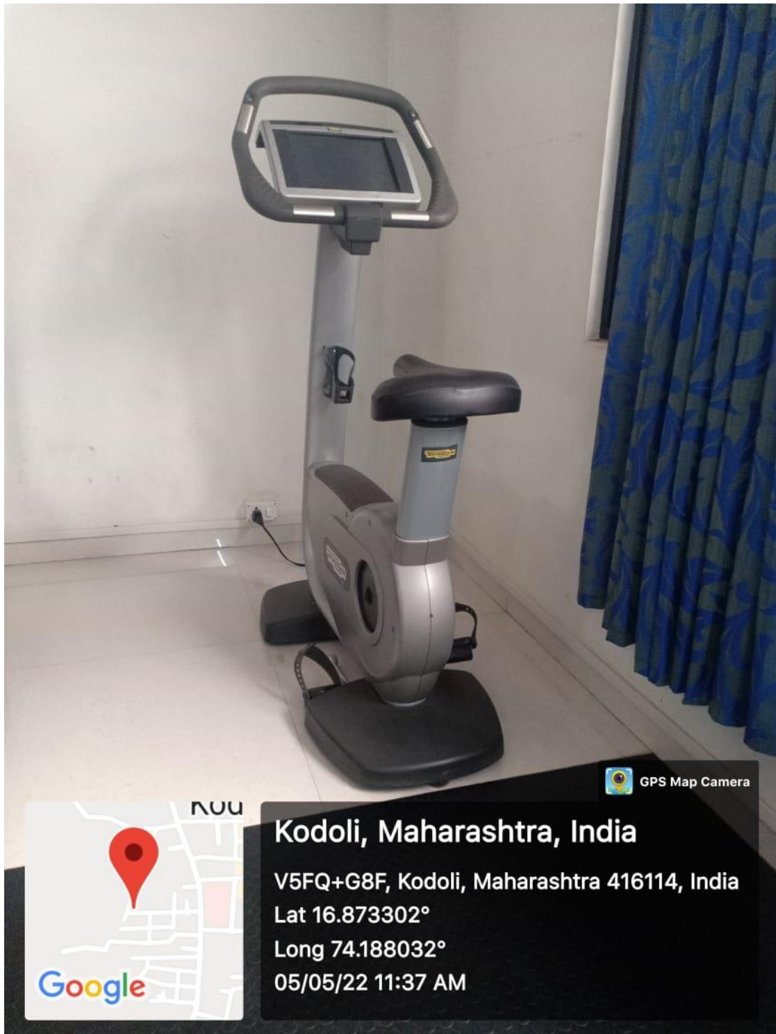
GYM facilities for hostel students