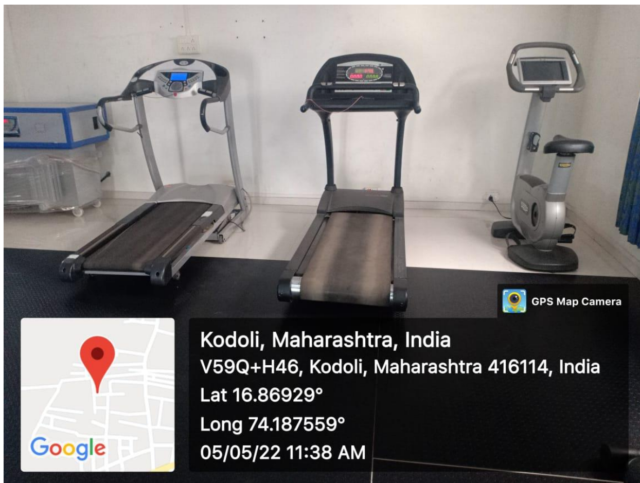
GYM facilities for hostel students